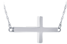
Sterling Silver Sideways Cross Necklace

Measures 1.1" w x .64" h Includes sterling silver chain that adjusts to 18" or 20" length