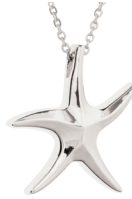
Stainless Steel Starfish