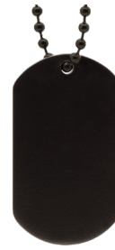
Stainless Steel Dog Tag Black Finish