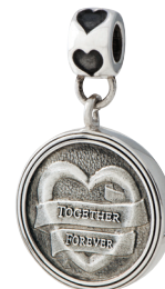
Together Forever 248426

Antique finish and colors will vary in intensity and appearance. Color of actual product may vary from photographic representation.