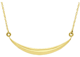
18K Gold Vermeil Swoop Necklace