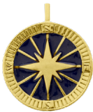
18K Gold Vermeil Compass - Blue Pendant*

Measures 1.1" w x .64" h Includes sterling silver chain that adjusts to 18" or 20" length