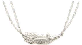
Sterling Silver Sideways Feather Necklace