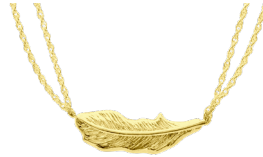
18K Gold Vermeil Sideways Feather Necklace

Measures 1.03" w x 1.03" h Initials engraving included