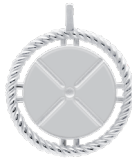
Sterling Silver Round Pendant*

Measures 1.03" w x 1.03" h Initials engraving included