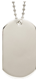
Stainless Steel Dog Tag Natural Finish

Dog tags have been used for years as an identifier of an important life. This personal tribute celebrates someone near and dear to you. Engraving is available and included for both finishes. The Stainless Steel Dog Tag includes a 24" beaded chain in matching finish.