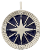
Sterling Silver Compass - Blue Pendant*