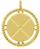
18K Gold Vermeil Round Pendant*