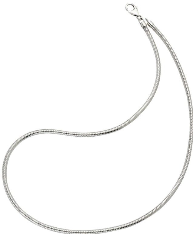
20" Stainless Steel Necklace

This necklace and bracelet pair with our medallion beads to create a meaningful keepsake.