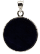
Sterling Silver Onyx Pendant* 283828