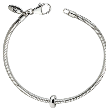
Sterling Silver Bracelet