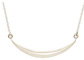
Sterling Silver Swoop Necklace