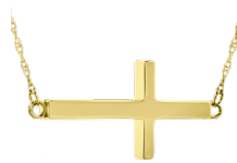
18K Gold Vermeil Sideways Cross Necklace