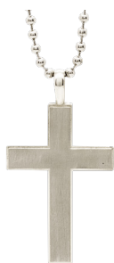
Stainless Steel Cross - Natural Finish

Celebrate the spirituality of your loved one with this collection featuring a wirebrush finish in natural stainless or black. 24" bead chain included.