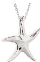
Stainless Steel Sideways Cross