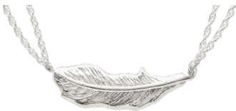
New! Sterling Silver Sideways Feather Necklace 283745

With their sideways orientation, these Sterling Silver pendants offer a unique look with a chain included.