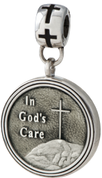
In God's Care 248413