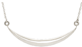
New! Sterling Silver Swoop Necklace 283744