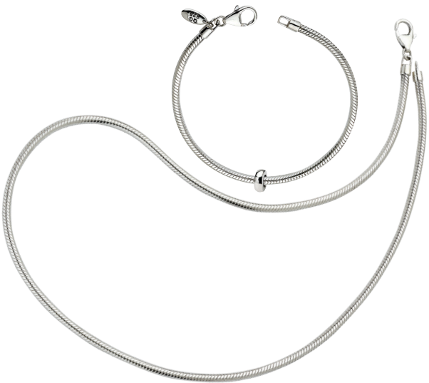
Sterling Silver Bracelet

A Sterling Silver bracelet or Stainless chain may be paired with medallion beads.