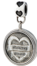
Together Forever 248426