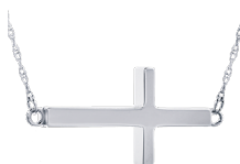
Sideways Sterling Silver Cross*