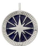
New! Sterling Silver Compass - Blue Pendant*