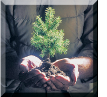
Living Memorial® Program