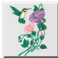
Embroidered Cap Panel